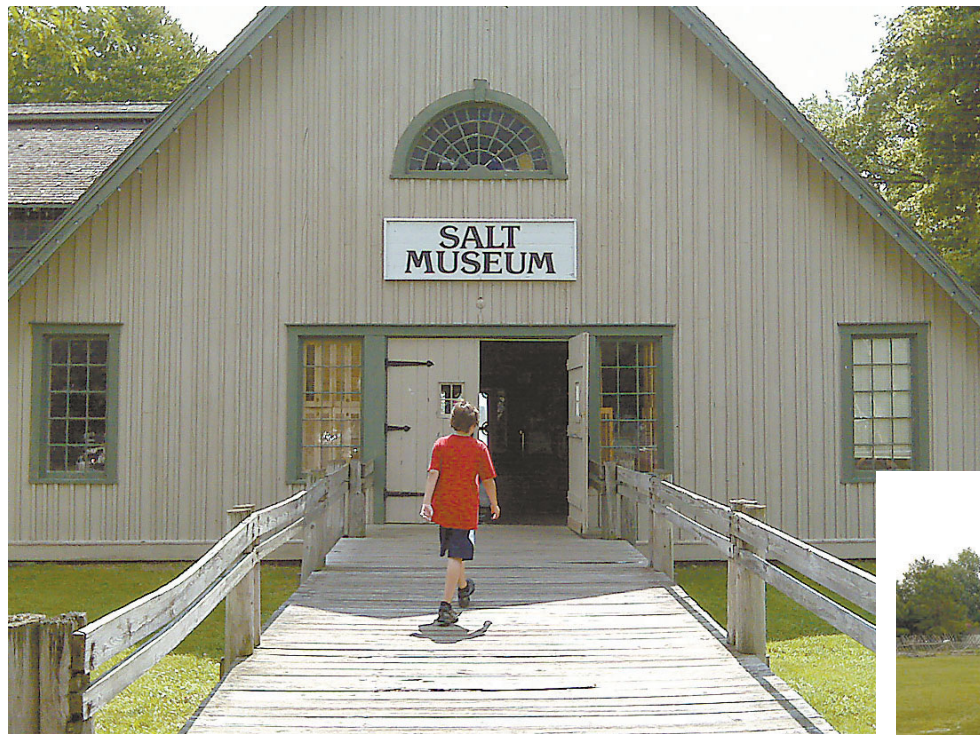
Salt Museum, Liverpool, N.Y. was one stop on the trip.